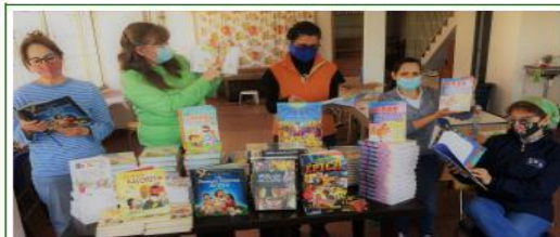
(Teachers checking out our stash of Bibles for kids.)