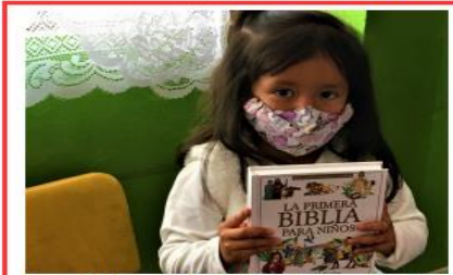
Every child received a Bible at their reading level!