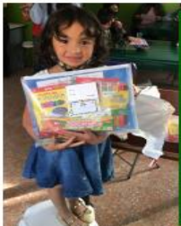
Every kid was given an academic kit!