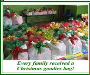
Every family received a Christmas goodies bag!